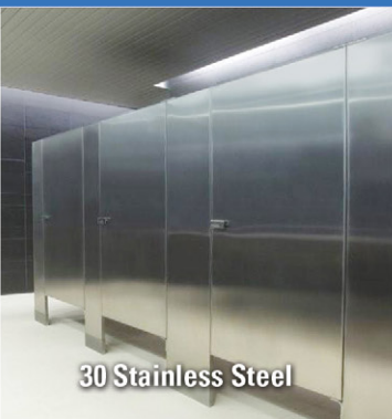
30 Stainless Steel